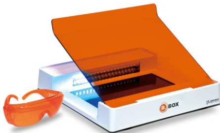
B-BOX™ Blue Light LED epi-illuminator