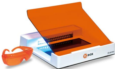
B-BOX™ Blue Light LED epi-illuminator