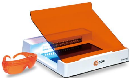
B-BOX™ Blue Light LED epi-illuminator